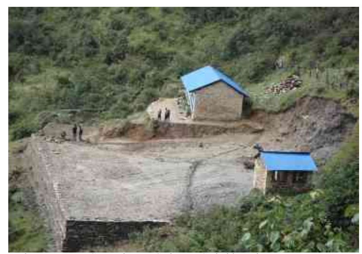
Playground of Shree Janachetana Primary School being recently constructed at Beni VDC ward no7, Solung, Solukhumbu