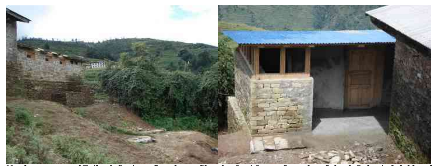
Newly- constructed Toilet & Sanitary Complex at Chandra Jyoti Lower Secondary School, Bakanje Solukhumbu

There was extensive discussion on the project description of upcoming school excursion program. Name list of participating teachers and the students for the enrollment were filled after having the consent of parents.