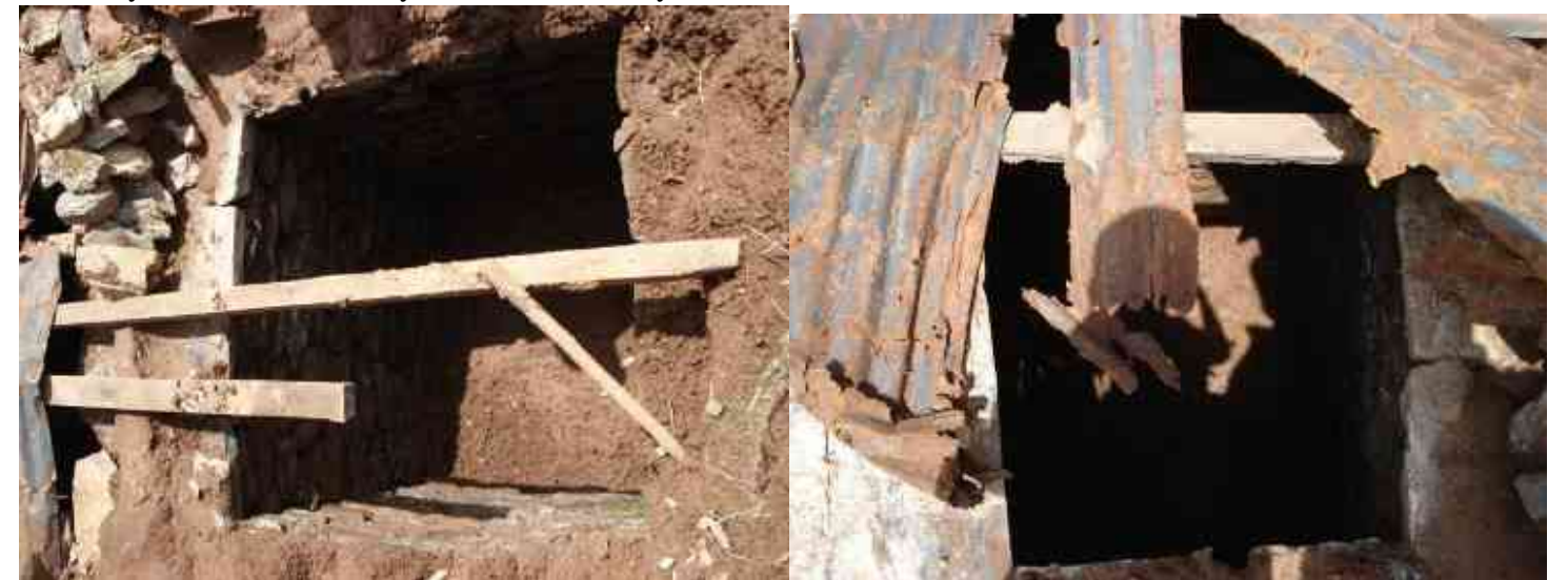
Septic tank of the toilet and sanitary complex is being constructed at Pikey Lower Secondary School, Tamakhani VDC

2 pits with dry wall have been constructed for the safety tank. Cement, iron rod, urinal tank, and other local materials like sand, concrete and timber have been collected for the toilet construction. Krishna said toilet construction would start after some days as all the necessary materials are ready for it.