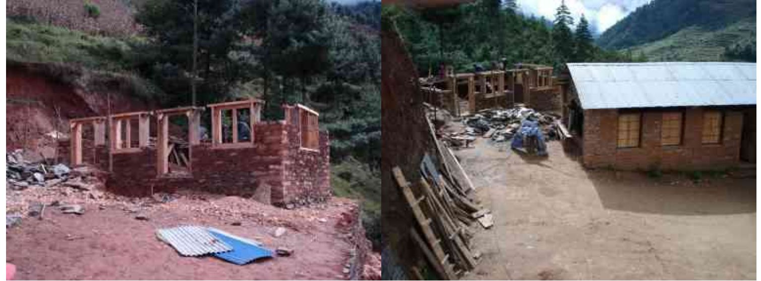
Science lab and office house is being constructed at Shree Jawla Mai Primary School, Tamakhani VDC, Solukhumbu