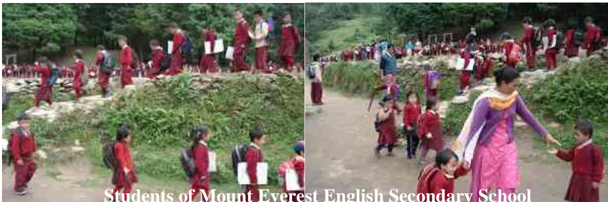
Students of Mount Everest English Secondary School