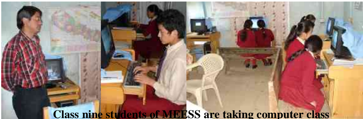
Class nine students of MEESS are taking computer class