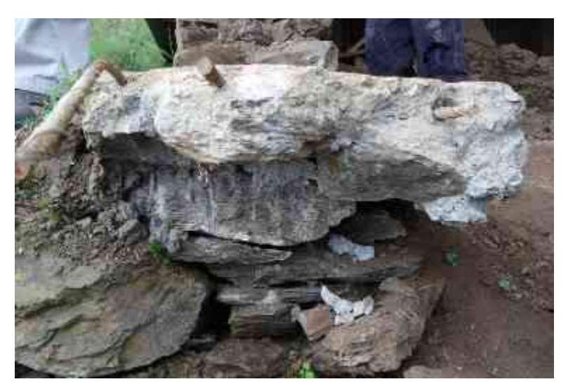
Cement Rcc made on the foundation for the stability of the office

We also monitored cement work of Gelbu. He has done good job with plaster, outside paving stone slate around surface of the school building, Cement topping wall along the highway. But regarding the work of cement RCC on the office foundation he had used bad stone and too less cement. So, the RCC was not strong enough to resist against the crack. But this is not the main cause of office damage.